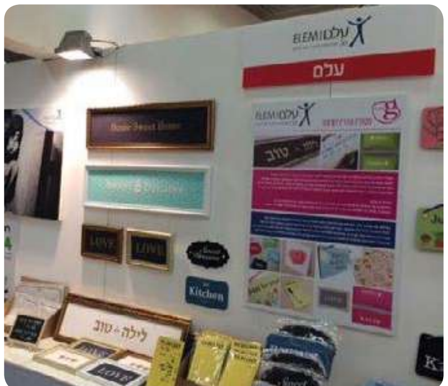
ELEM's stand at Bank Hapoalim's Non-Profit Fair