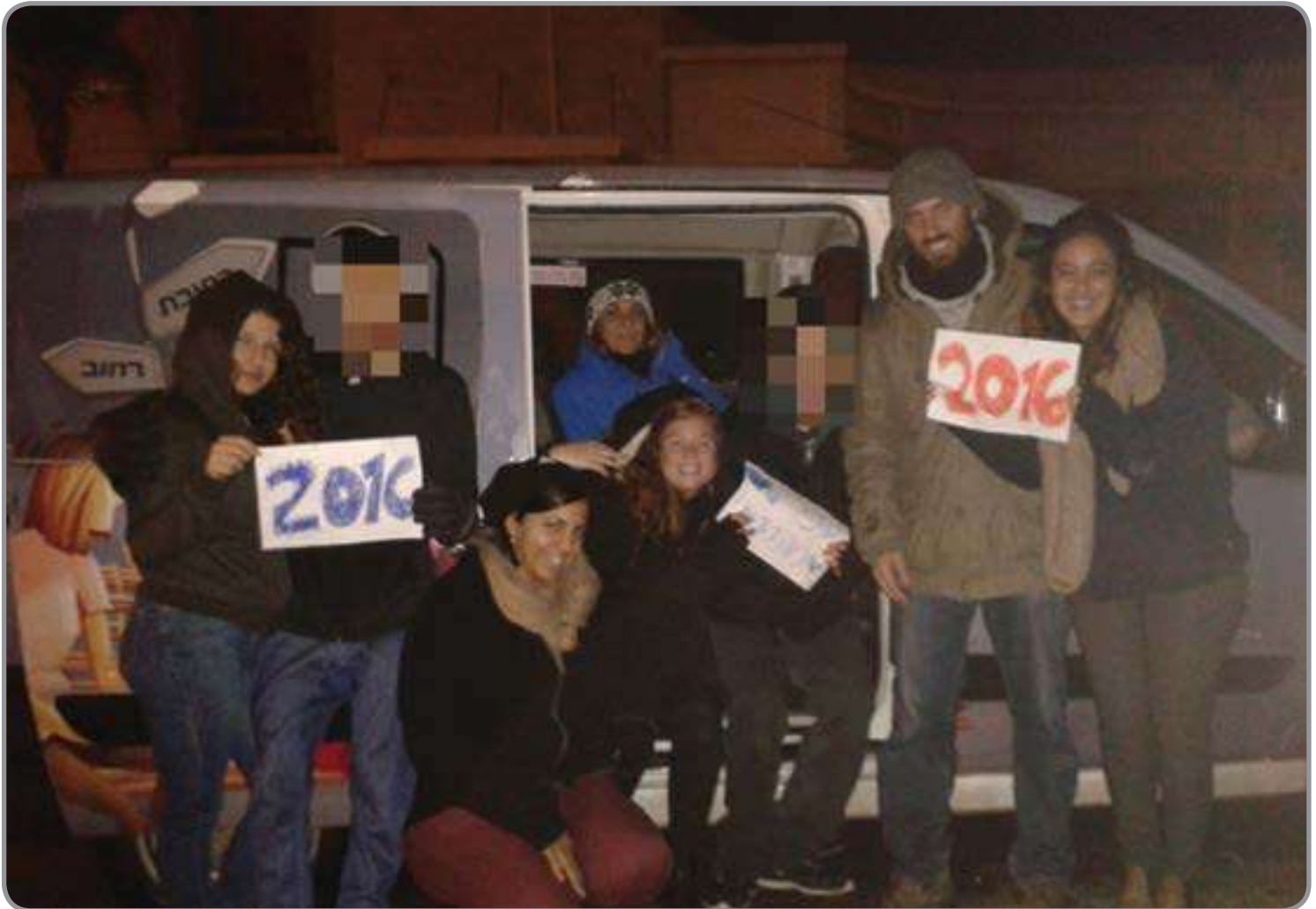
Youth and Staff of Ofakim's Outreach Van