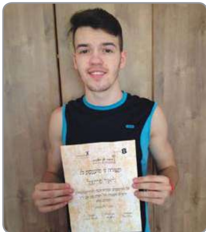
Completion of Bezeq Online’s Course- “Derech Hamelech” Be’er Sheba

ADAMA, Bezeq, Ima Foundation, Jewish Federation of Greater Kansas City