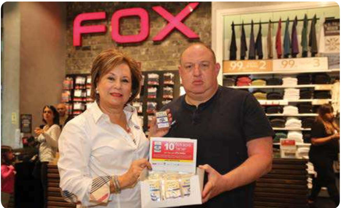
Annual campaign sale of Israeli flags at chain stores of the FOX Group