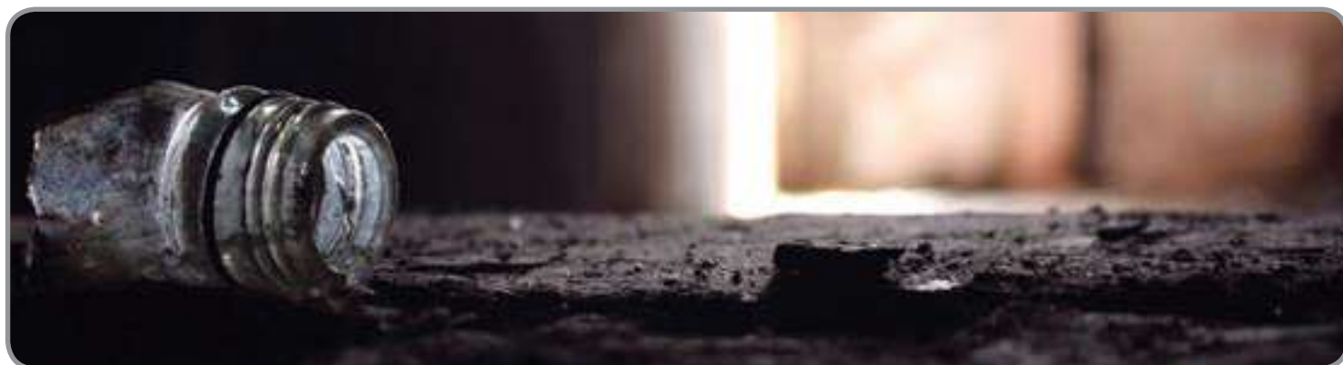
Yana, a girl from the youth center in Nazereth Illit

Involvement in prostitution is a complex phenomenon to both detect and report. Many minors provide sexual services for a fee, however are not aware that they involved in prostitution. We are witnessing a growing phenomenon in which prostitution is occurring in chat rooms on the internet, in closed Facebook groups, and on seemingly innocent dating sites, making it difficult to detect minors.