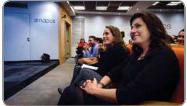
Appreciation evening for streetwork volunteers at Amdocs

month-long workshops concerning issues related to body image. In addition, as part of the volunteering partnership with Unilever, a great number of activities took place with employees of the company throughout Israel and the youth from the centers. As part of these activities the youth enjoyed special days which included volunteering together for a third party within the community.