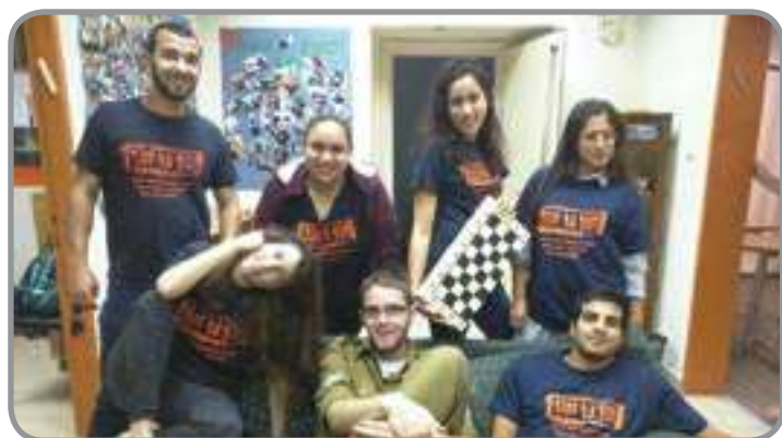
Sderot's youth center staff