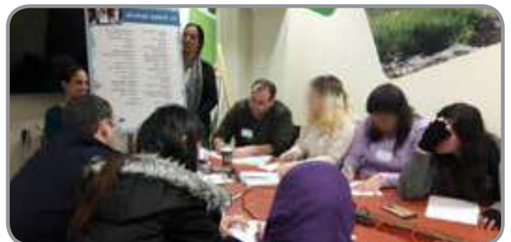
Employees from Unilever and girls from youth centers in the North preparing to lead a joint workshop on body image.