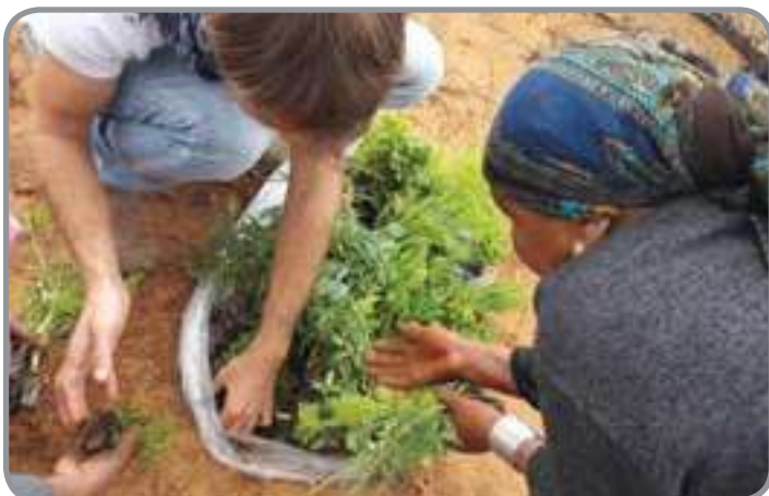
The Angel program working in partnership with the Faculty of Agriculture in Rehovot

the Directors of the National Program, youth and young adult service inspectors, and the Ya'arim youth village.