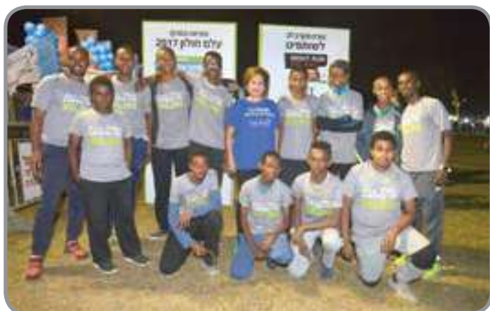
Kiryat Malachi's Youth Center Group at ELEM's Annual Race