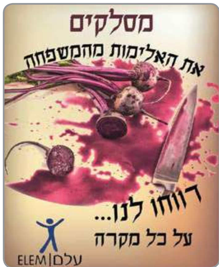
Poster created by Koby Rotenberg, a young adult from “Derech Hamelech” Tel Aviv, as part of a graphic design course.

institutions. Over the course of building the various trainings programs, we found that individual trainings have a unique value in the development of an employment outlook for the youth and young adults. Individual trainings enable the creation of a personal in-depth process and individual adaptation of the youth to the field of study. The individual training takes place following a clarification of the youth’s employment tendencies, their accuracy, and individual preparation and guidance providing the youth with the motivation and tools necessary to attain success in the process and integrate into a place of employment that is suited to their capabilities.