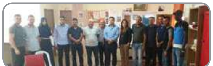
Visit of Knesset member Ayman Odeh to the “Finjan” youth centers in the Bedouin villages in the Negev.