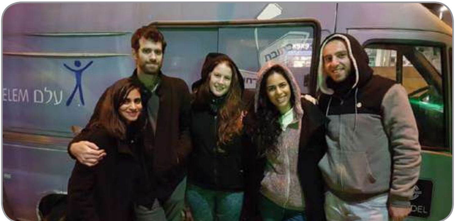
The staff of Ashdod's outreach van