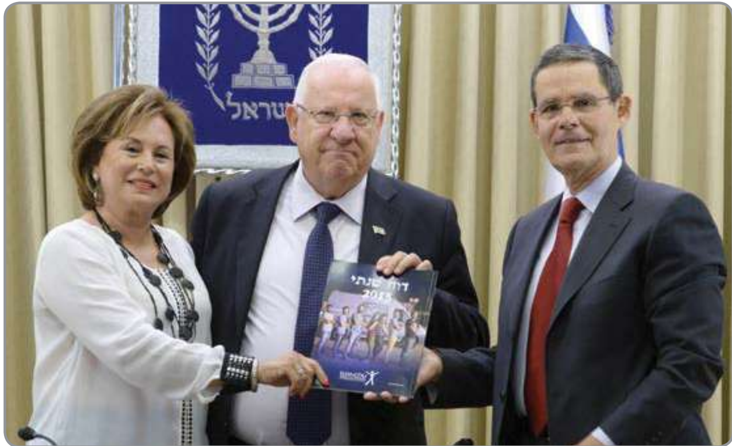
Presenting ELEM's 2015 Annual Report to the President of Israel Reuven Rivlin