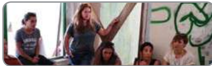
A tour at a "squatter's home" as part of the "Open House" exhibition.