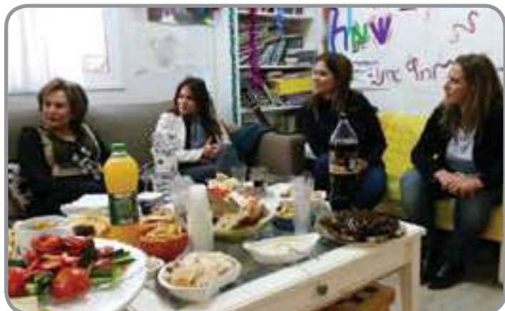
Visit of Knesset Member Meirav Ben Ari, Head of the Committee for the Treatment of Homeless Young Adults at the "Someone to Run With" Center

including psychological assistance, medical treatment and assistance in exercising their rights. In cases where there is a motivation for change, the young adults are given the opportunity to take part in a long-term rehabilitation process.