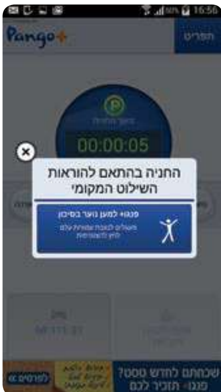
Partnership with Pango+ and Round Up