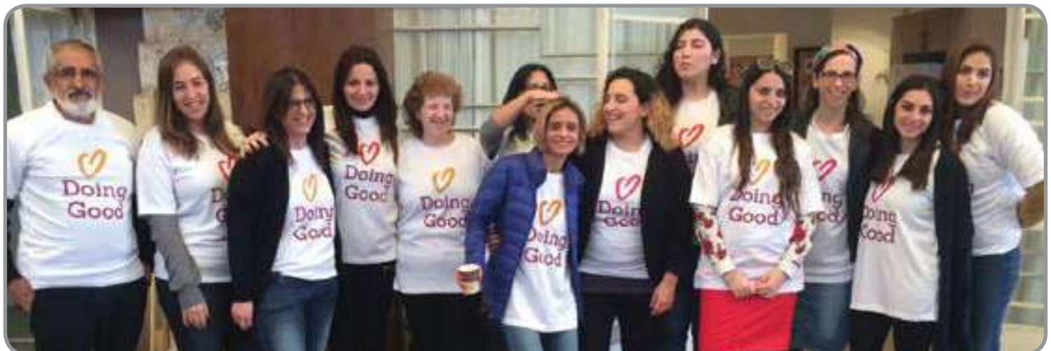
National Insurance employees gardening at the "Halev 24/7" center as part of Israel's Day of Good Deeds.