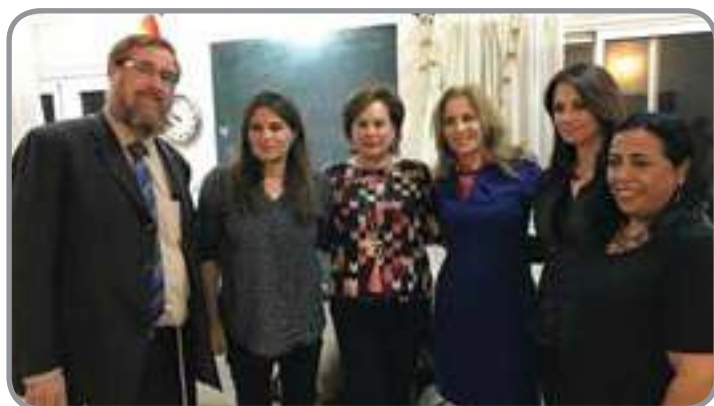
Visit from the Committee for Rights of the Child at Halev 24/7