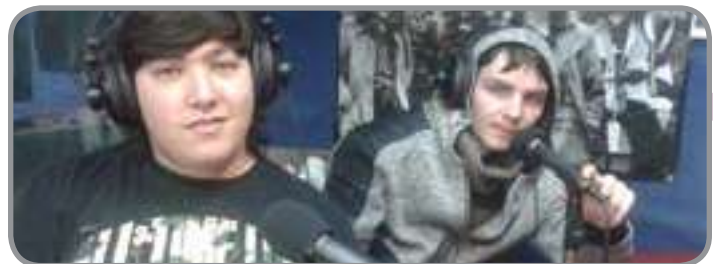
Youth broadcasting on Sderot’s social radio