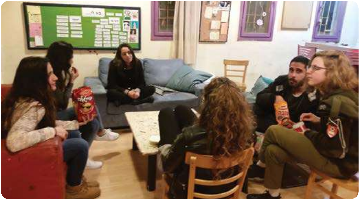
Osem - year-round donations to all the projects nationwide