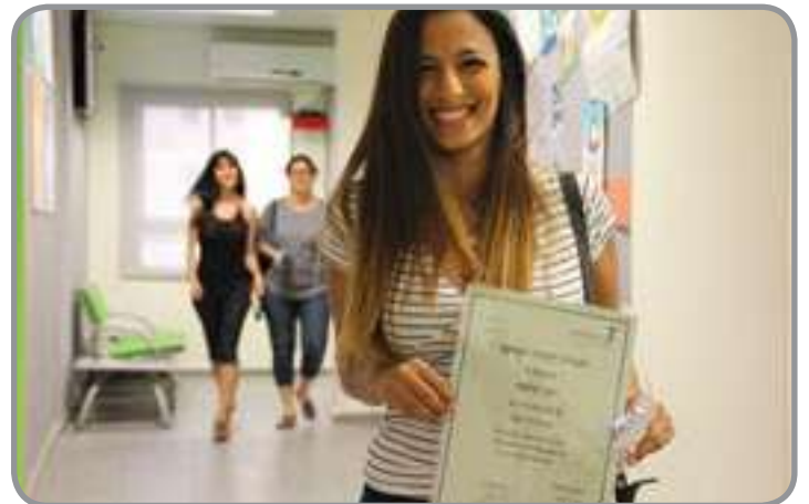
Appreciation of ELEM volunteers in Petah Tikva